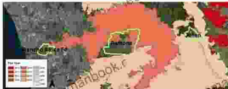
Figure 1—Study site map showing fire risk in the WUI area, 2000-2010.